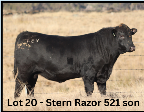
Lot 20 - Stern Razor 521 son