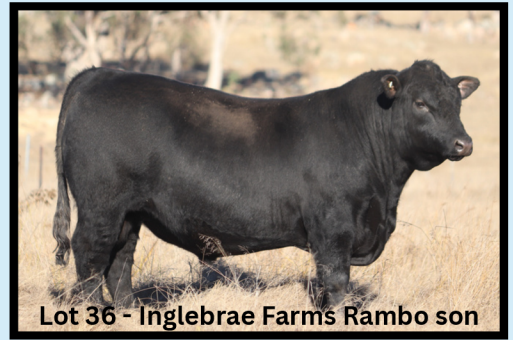
Lot 36 - Inglebrae Farms Rambo son