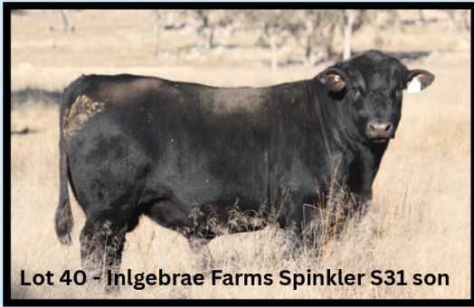
Lot 40 - Inglebrae Farms Spinkler S31 son