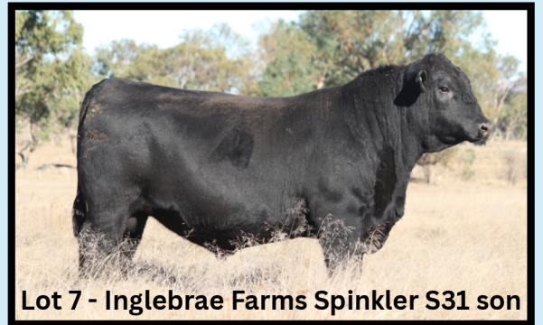
Lot 7 - Inglebrae Farms Spinkler S31 son