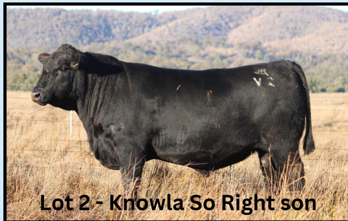
Lot 2 - Knowla So Right son