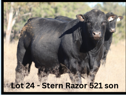
Lot 24 - Stern Razor 521 son