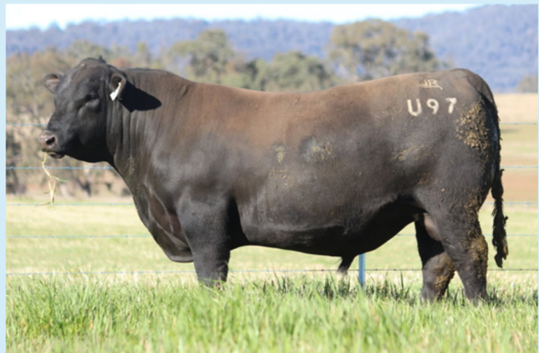
2025 Top Price Bull. Lot 1 sold to Adrian & Megan Forrest, Augathella

We have been delivering bulls personally for the past 8yrs along the New England, Northern Slopes & Plains, Northern Rivers and through to Roma Qld and of course locally!